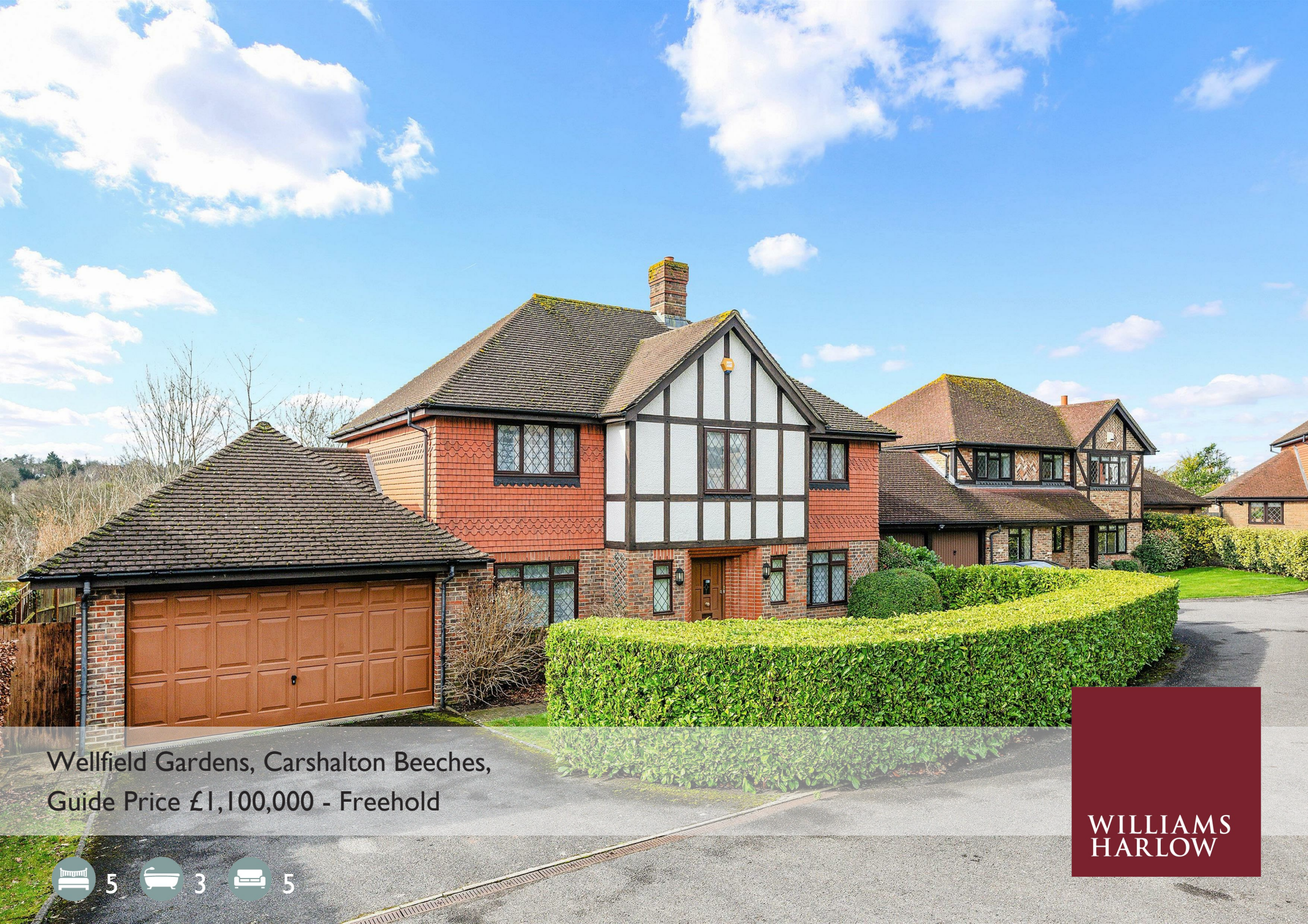
Wellfield Gardens, Carshalton Beeches, Guide Price £1,100,000 - Freehold